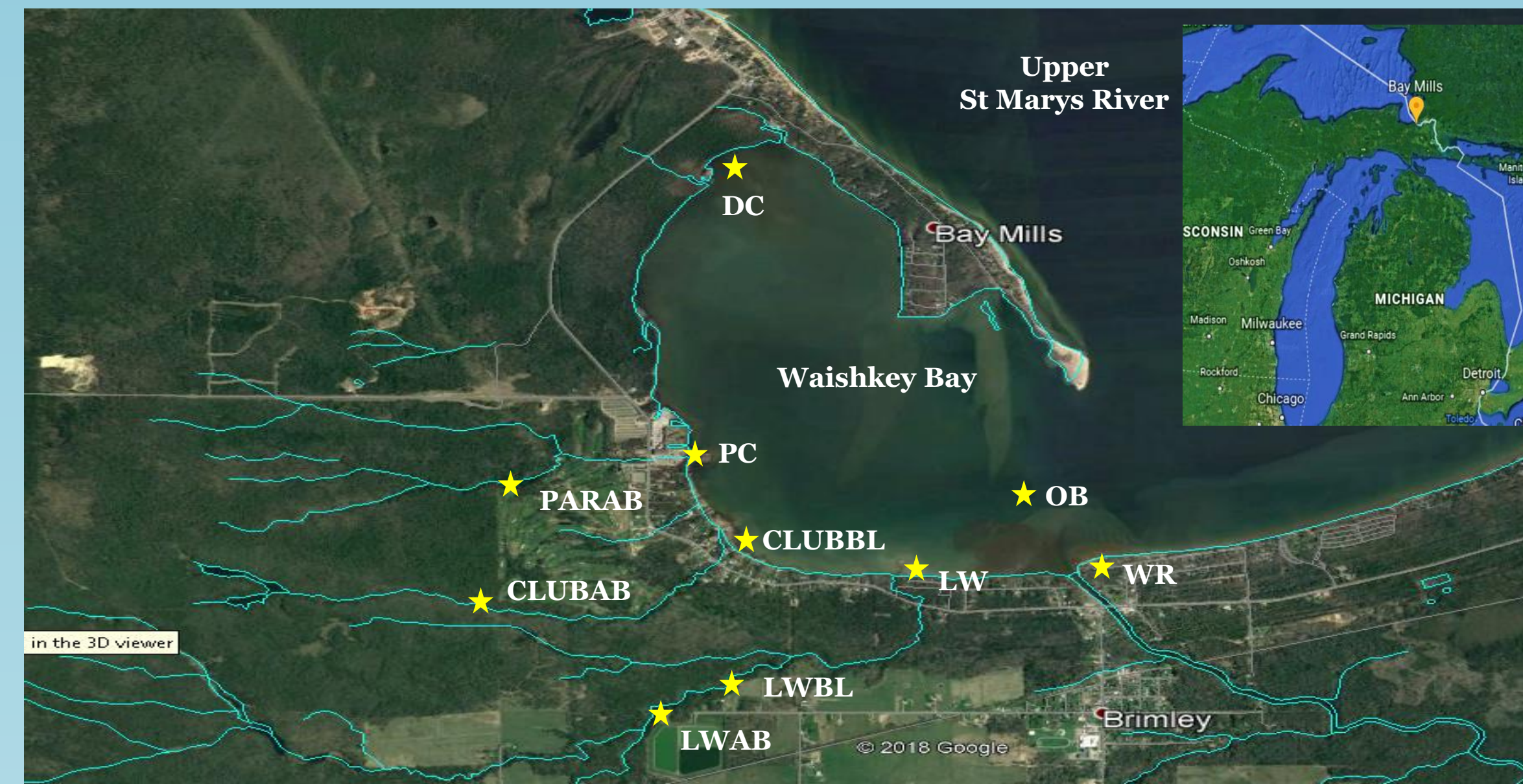
Figure 1: Map depicts the locations of the 10 sites from which the water and sediment samples were taken. One site is in the open bay while the other nine are in tributaries or their outlets into the bay.