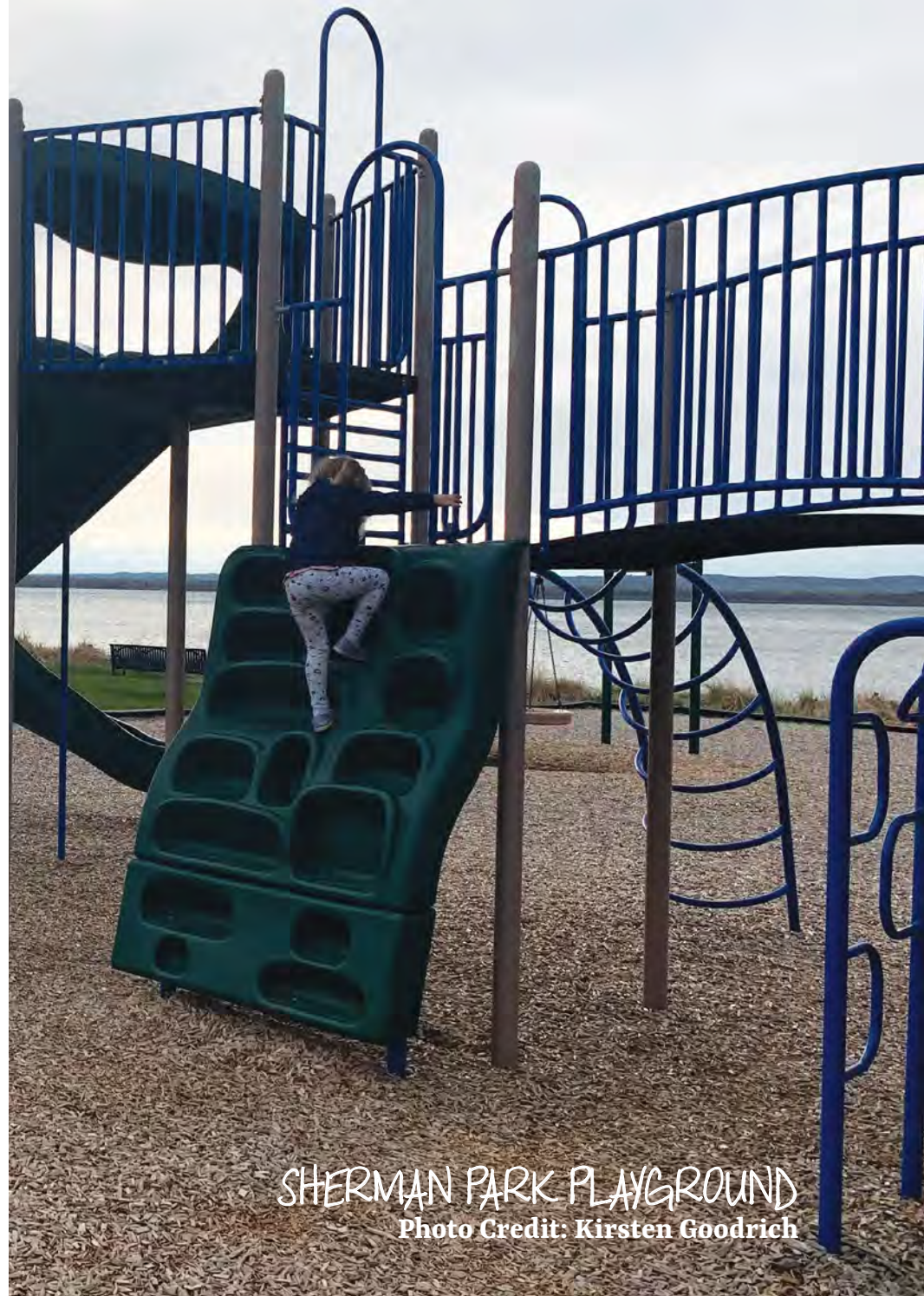
SHERMAN PARK PLAYGROUND