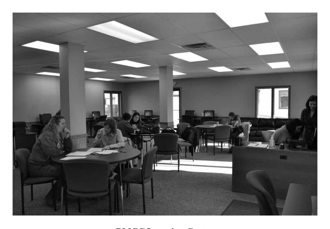
BMCC Learning Center

Sexual harassment, as summarized by the Equal Employment Opportunity Commission (E.E.O.C.), includes unwelcome sexual advances, requests for sexual favors, and other verbal or physical conduct or communications of a sexual nature. Anyone in violation of this policy is subject to disciplinary action and legal sanctions.